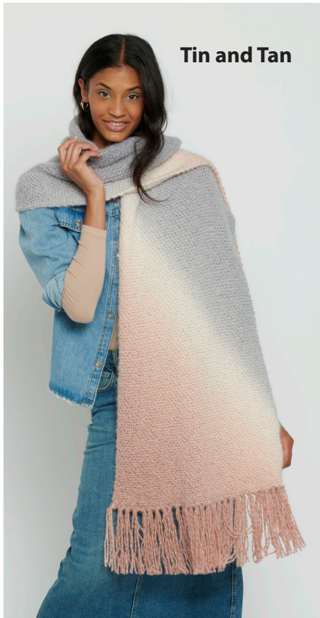
Tin and Tan