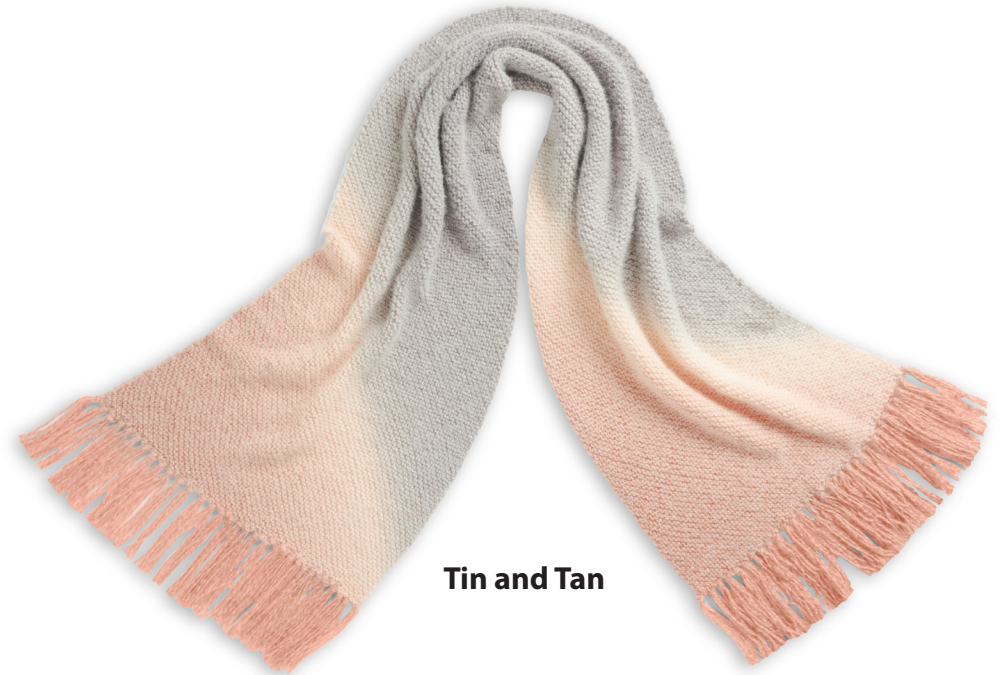
Tin and Tan